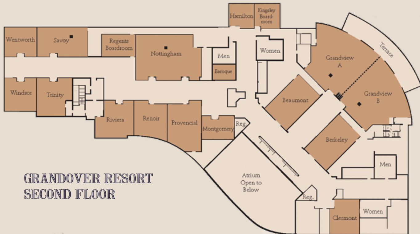
GRANDOVER RESORT SECOND FLOOR