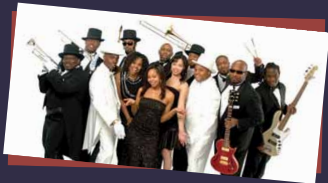
Big Swing and the Ballroom Blasters

Following the Inauguration, all meeting attendees and their guests are invited to the Inaugural Reception to celebrate Dr. Schaaf's new role at the Medical Society. The evening will feature light hors d'oeuvres, drinks, and dancing to the big-band music of Big Swing and the Ballroom Blasters.