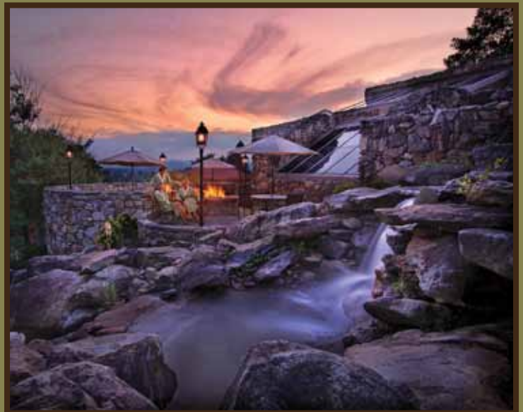
The Grove Park Inn Resort & Spa