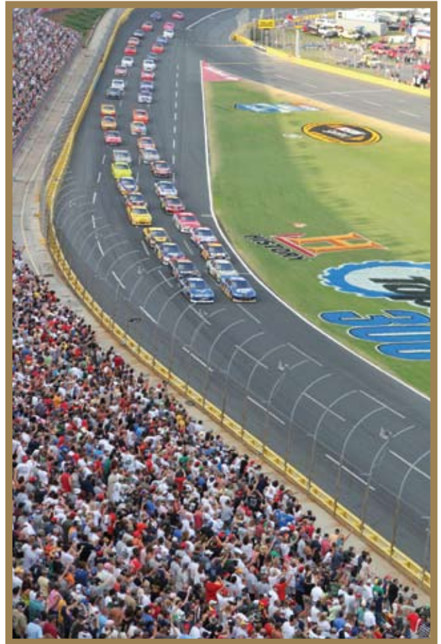
Charlotte Motor Speedway

Please call the NCOGS office at (919) 833-3836, or inquire by e-mail at nlowe@ncmedsoc.org .