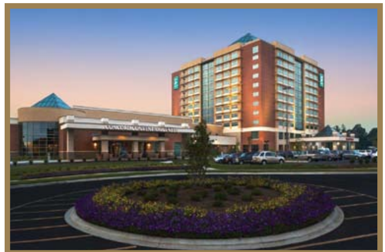
Embassy Suites Charlotte-Concord Golf Resort & Spa

Dress for the meeting and social events is business casual.