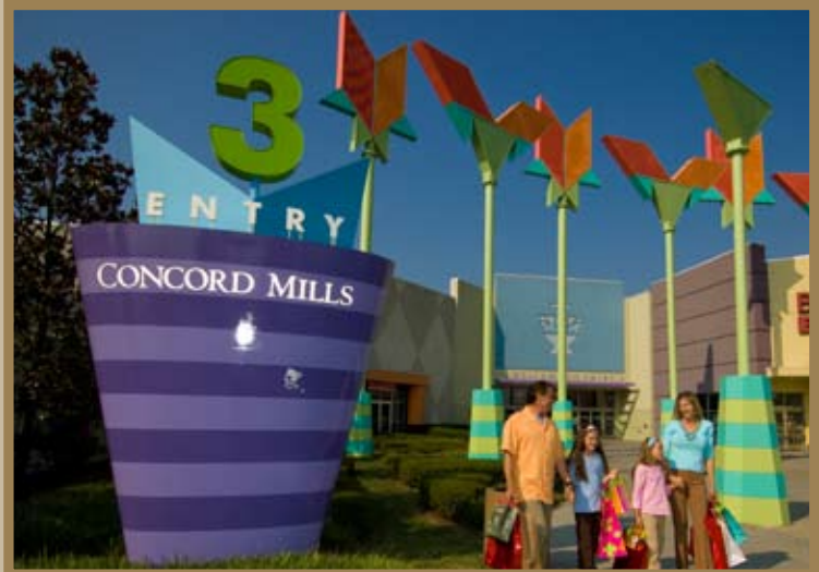
Concord Mills Mall

As a new feature, a hands-on session for residents and fellows will take place Saturday afternoon. This informative simulation skills session, What Do You Really Know About Electrosurgery? can accommodate a maximum of 20 participants. There is no fee for this session, but pre-registration is required.