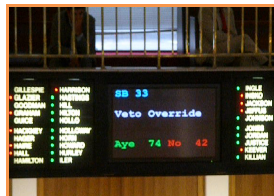
NC House votes to override veto of SB 33

Within 36 hours of the House veto override vote, the plaintiff's lawyers were working to delay implementation of the cap on noneconomic damages. The NCMS will remain diligent in its efforts to protect the integrity of reforms in SB 33 and to ensure their appropriate implementation. We have been assured by several plaintiff's lawyers that the cap on noneconomic damages will be challenged in court. NCMS is preparing to defend the cap in court and in the General Assembly. Physicians will be hearing from the NCMS about ways to help defend these important reforms.