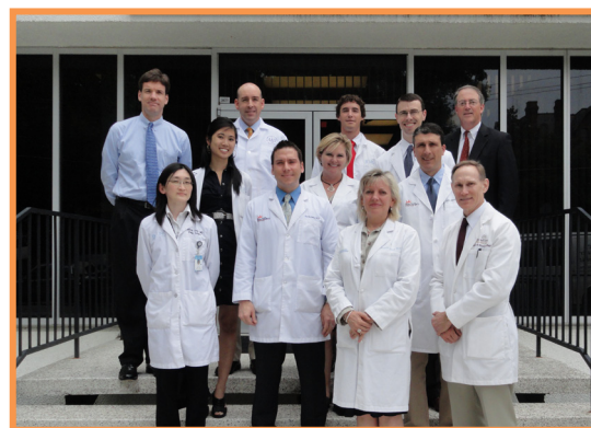
NC Dermatology Association White Coat Wednesday

Summary: This legislation was developed by an NCMS Leadership Scholar and was strongly supported by the NC Dermatological Society. Sponsored by the three physician members of the Senate, SB 471 proposed to raise the age at which a prescription is required for a child to engage in indoor tanning. Current law requires a prescription at age 13, this bill would have raised the threshold to age 17. After receiving a favorable report from the Senate Health Committee, the bill was referred to the Senate Commerce Committee, where it was not debated. Failing to meet the crossover deadline, this bill is not eligible to be heard in the 2012 short session.