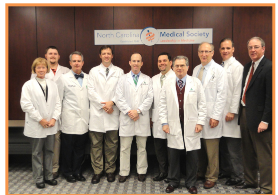
NC Orthopaedic Association White Coat Wednesday