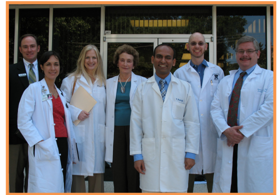
2011 Leadership College attending White Coat Wednesday