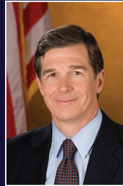
Attorney General Roy Cooper